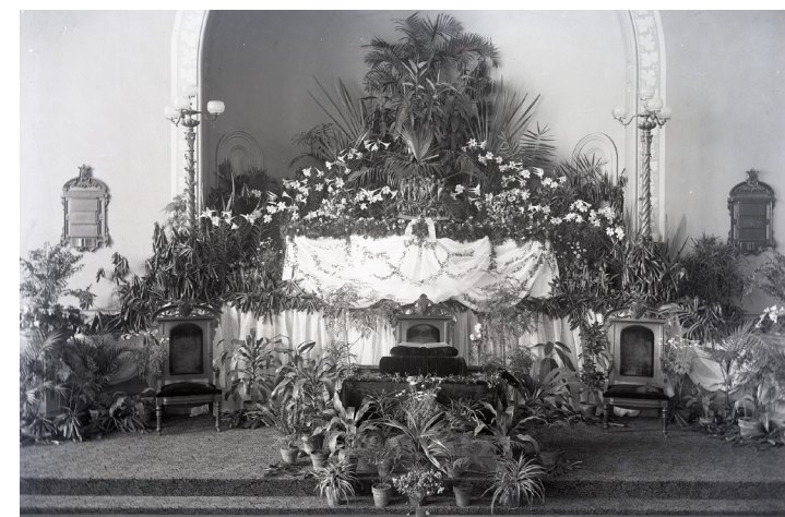
Palms, lilies, and ivy were frequently incorporated into Easter decorations in the 1890s.